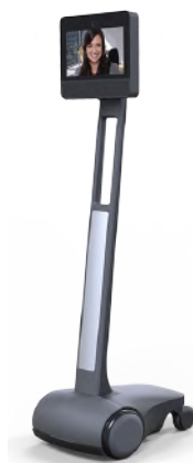
Figure 3: GoBe Robot

Blue Ocean Robotics places a high degree of emphasis on the design aspect of its products, providing a truly solid design that offers an aesthetic appeal and serves the intended application with full efficiency. In line with this, Blue Ocean Robotics discovered a critical challenge related to communication issues faced by service sector personnel, which was solved with a game-changing robotic design known as GoBe Robots, which are Telepresence Robots. Many advanced communication technologies, such as email and videoconferencing, have often failed to connect personnel who work remotely. In the healthcare industry, telemedicine is widely adopted to provide telecommunication technology remotely. While telemedicine has been around for a while, the key challenge is that it has to be managed and operated manually to perform the communication through a phone or tablet computer. This type of framework lowers the efficiency of the healthcare worker, and could negatively impact patient health or lose business for the hospital. Because Blue Ocean Robotics has a huge customer base in the healthcare sector, it wanted to help these customers overcome the challenges of manually-controlled telemedicine solutions. Therefore, in 2019, Blue Ocean Robotics acquired Suitable Technologies' assets and rights to its iconic GoBe Robots.