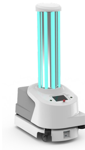
Figure 1: UVD Robot

Blue Ocean Robotics' flagship product, UVD Robots, enable hospitals to reduce transmission of viruses, bacteria, and microorganisms. Healthcare-Associated Infections (HAIs) drive up costs in the global healthcare sector. With the recent coronavirus (COVID-19) pandemic coming out of China, hospitals have been witnessing a rapid increase in patient count. These increases facilitate the spread of such infections making them difficult to control within the hospital premises, because the hospital environment is not frequently disinfected as much as it should be.